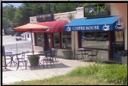
Cafe' Roche' Coffee House Means Our Coffee Rocks!