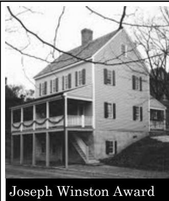
Joseph Winston Award